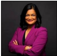
Congresswoman Pramila Jayapal