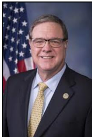
Lt. Governor-Elect Denny Heck