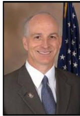
Congressman Adam Smith