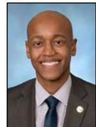
King County Councilmember Girmay Zahllay