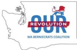
Our Revolution Washington